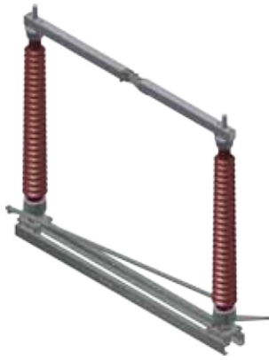
CBD (72.5-550) kV