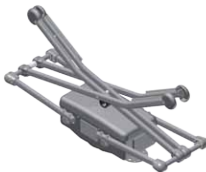
TFPA (170-245) kV