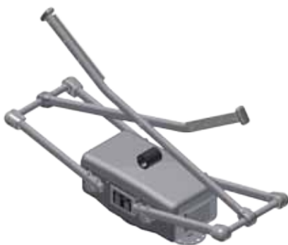
TFPK (72.5-170) kV