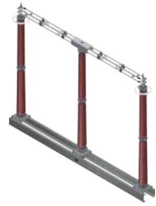
TFX (170-420) kV