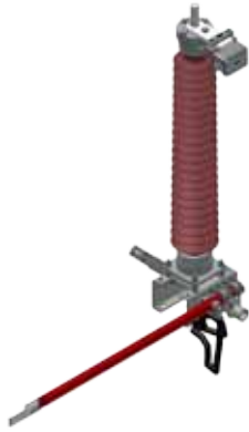
EF (24-550) kV