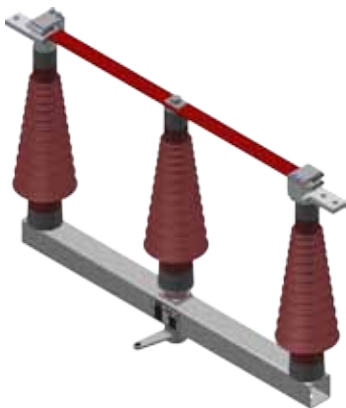
TID (72.5-123) kV