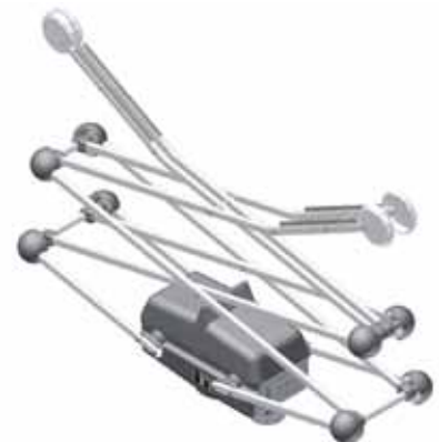
TFP (245-550) kV